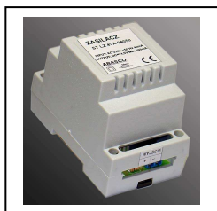
Power supply for TS-35mm bar