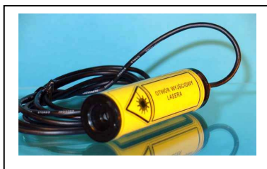
Laser line generator