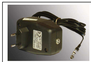
Power supply with LEMO connector